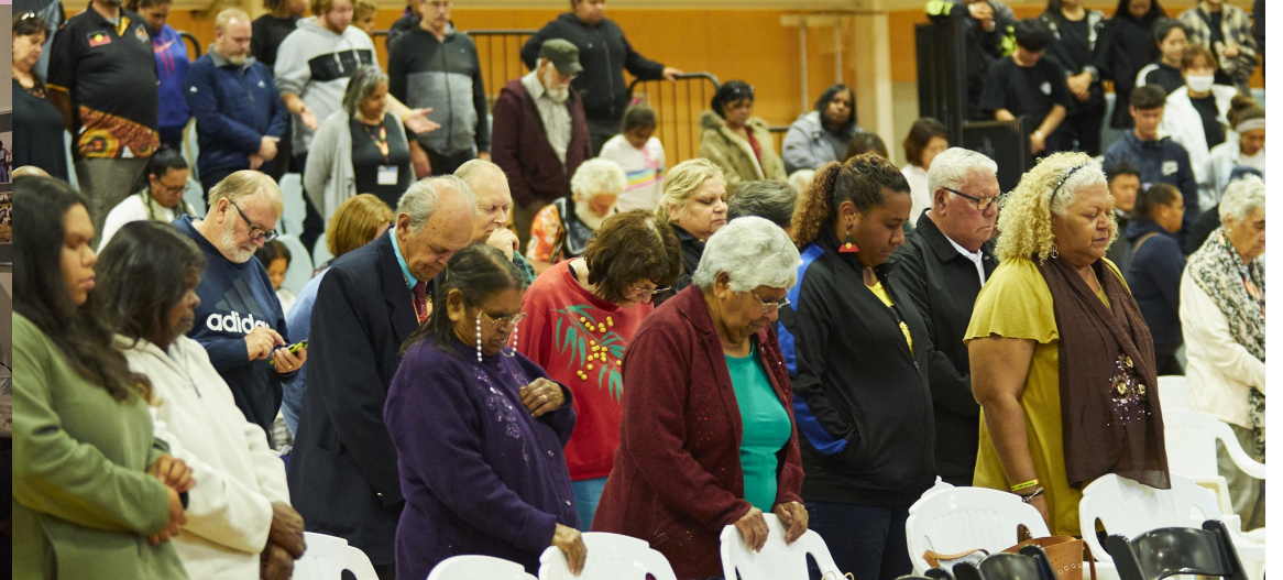
A beautiful time of fellowship, worship and prayer!