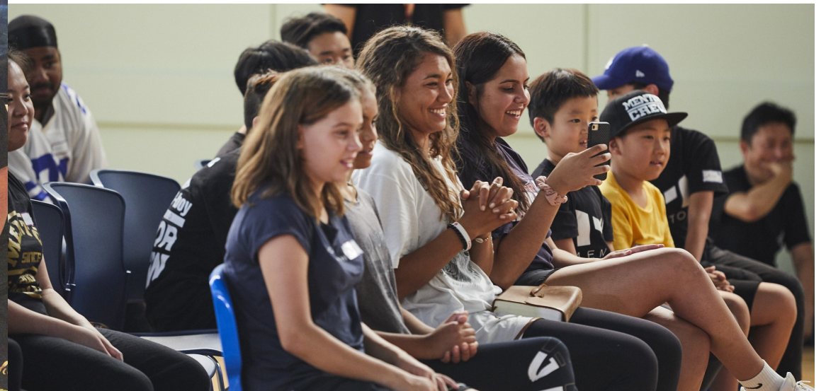
Young people enjoying the Convention workshops.