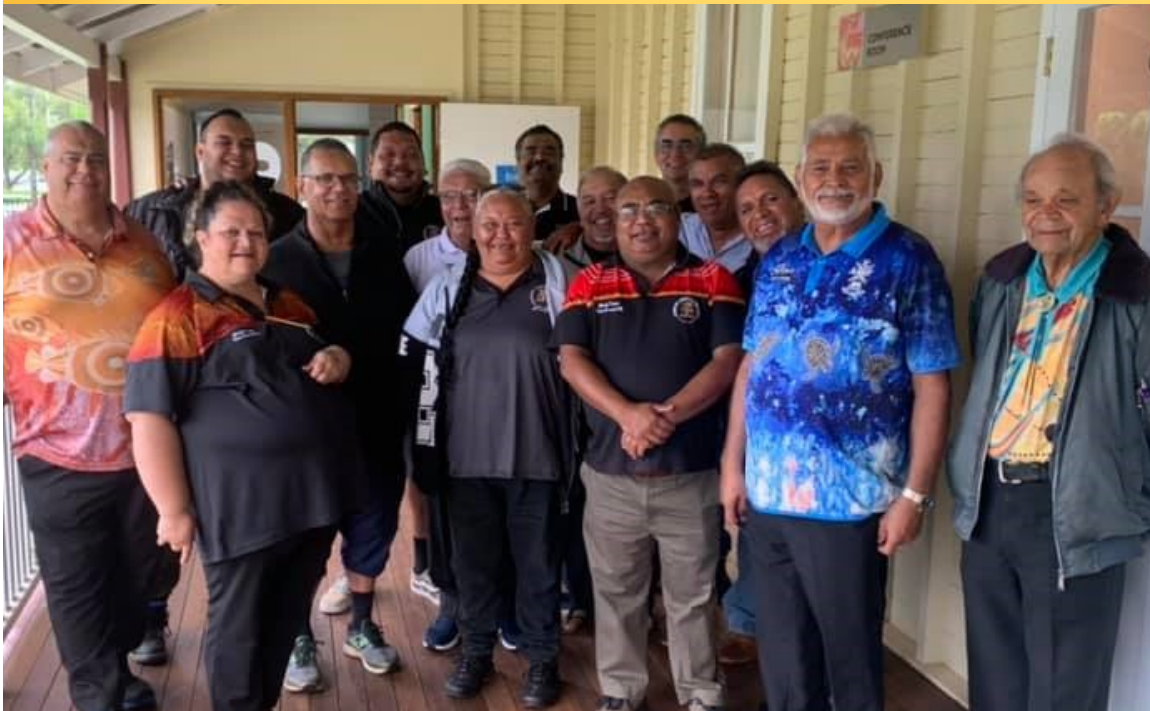
Above: The AEF Federal Council meeting seen here with the Town Council and CEO of Cherbourg Qld.