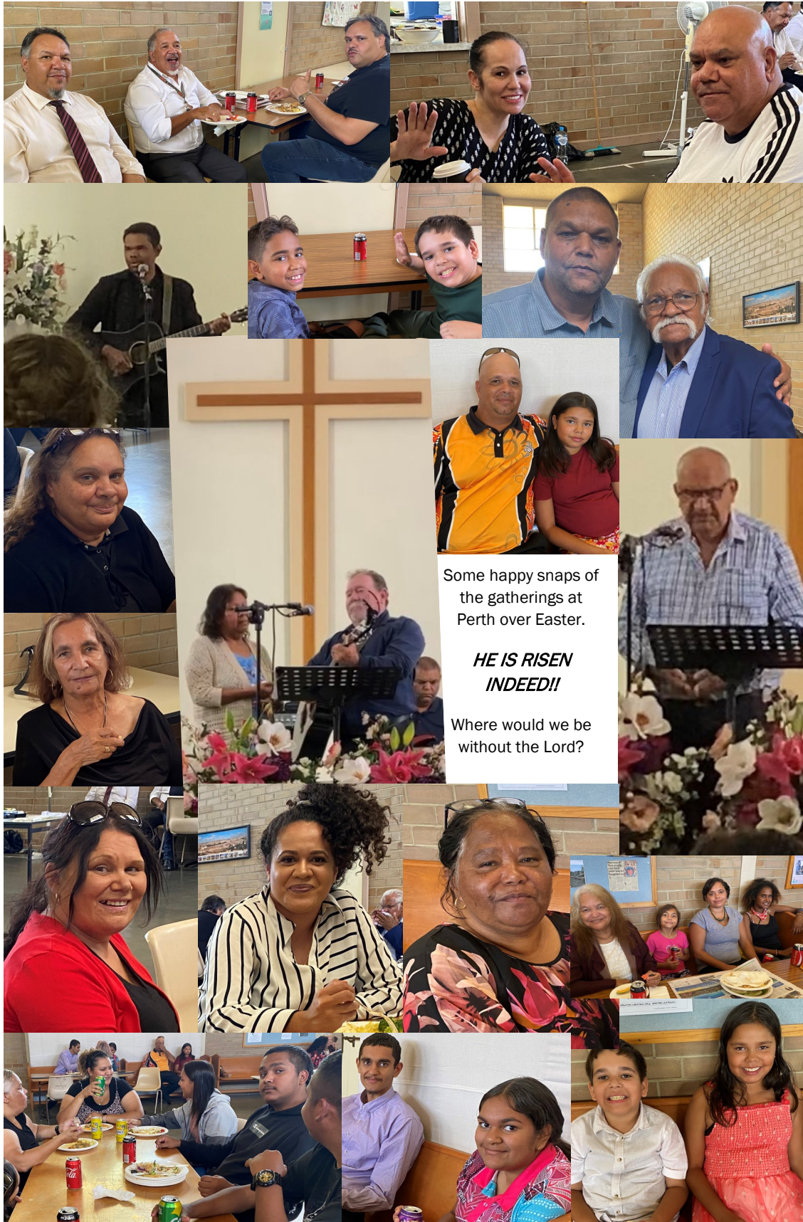
Some happy snaps of the gatherings at Perth over Easter.