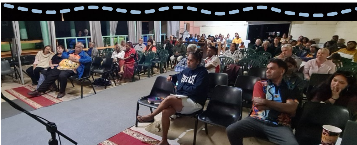
Above: Cherbourg Church Easter Convention