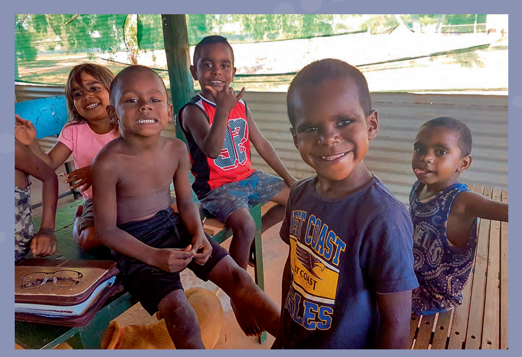
Above: One Arm Point kids at Bardi Christian Fellowship Church, WA.